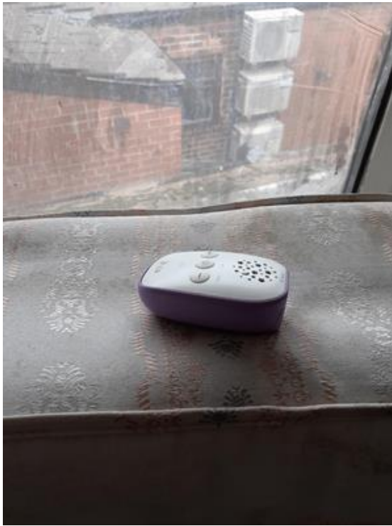
Exhibit DBR4 - Photographs Taken on the 11th August 2021